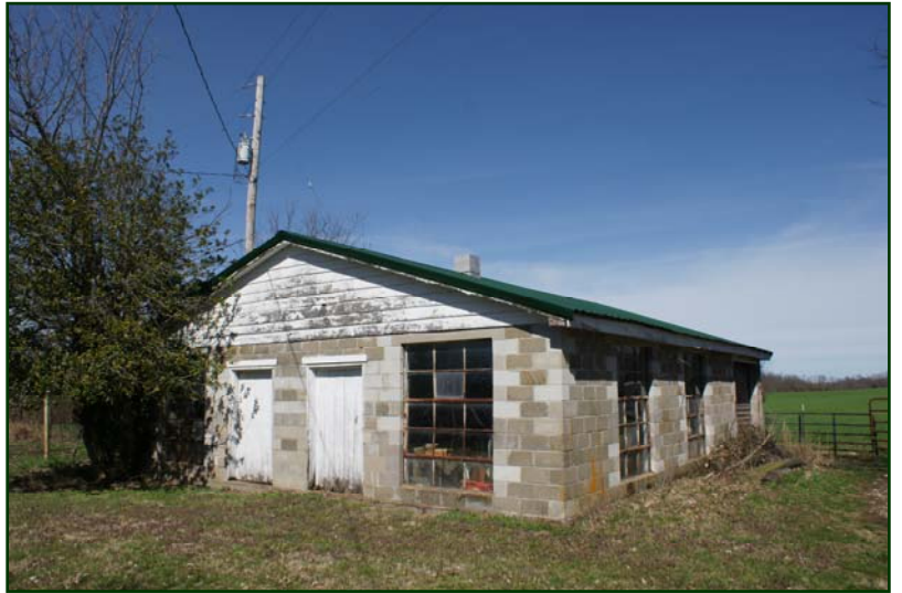
Excellent workshop (20' x 27.5') with plenty of light.