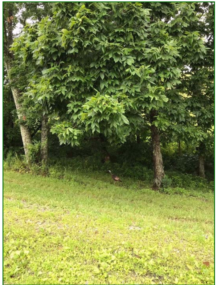
Wild turkey, deer, and other wild life—a hunter's paradise!