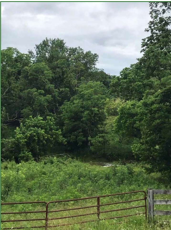
Eagle Creek and smaller tributaries throughout the property.