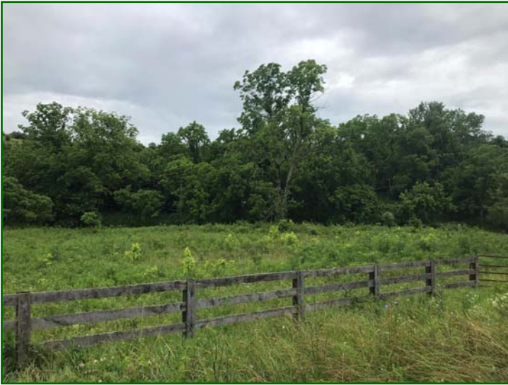
Ample frontage along Davis Road. Entrance leads to an older tobacco barn and rustic cabin.