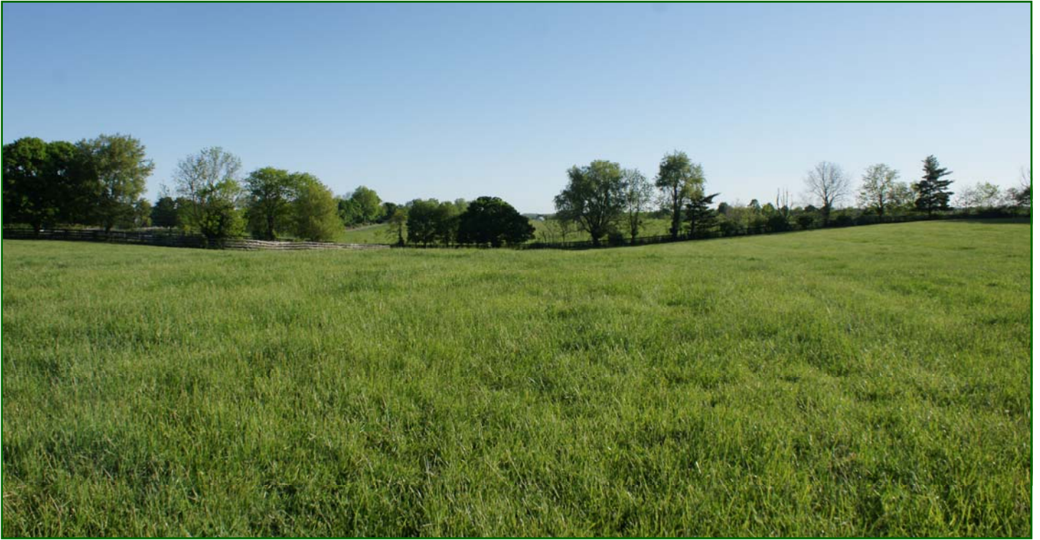
Two fields containing exceptional soil