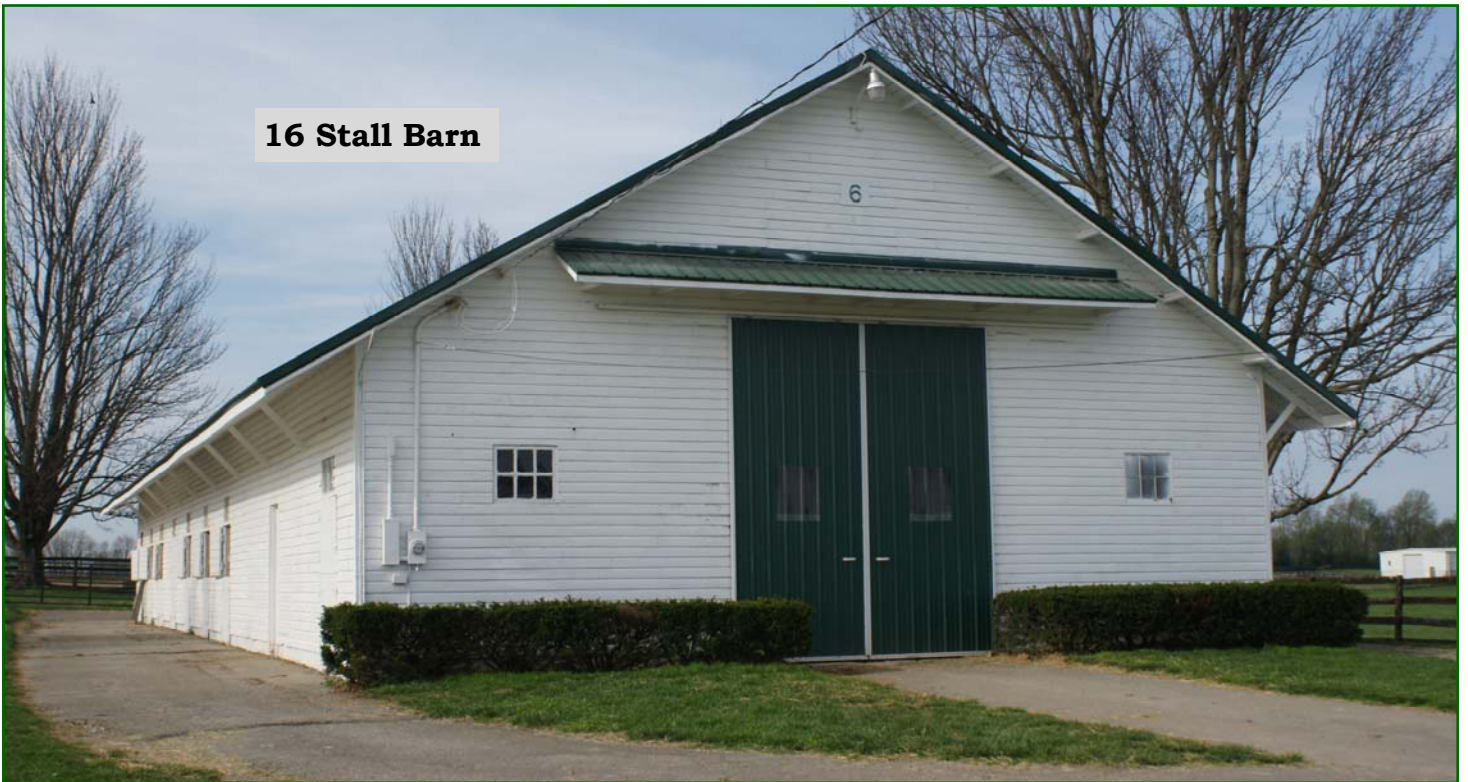
16 Stall Barn