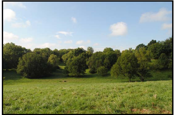
Road frontage on 2 roads- Fort Springs Rd. 2058 ft and Parker's Mill Rd 500 ft.