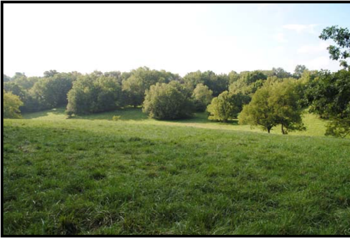
In the immediate area of Keeneland Race Course and Bluegrass Airport.