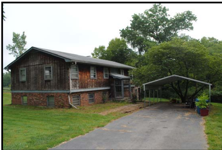
Approximately 3000 SF of living space with 3 bedroom and 1.5 bath.