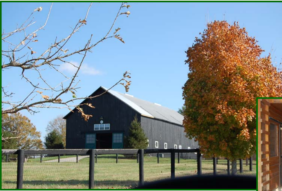
16 Stall Converted Tabacco Barn