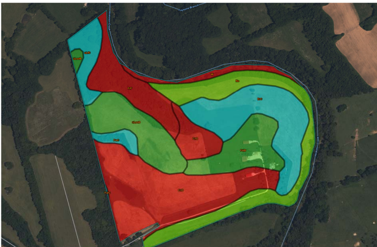
Summary by Map Unit — Bourbon and Nicholas Counties, Kentucky (KY604)