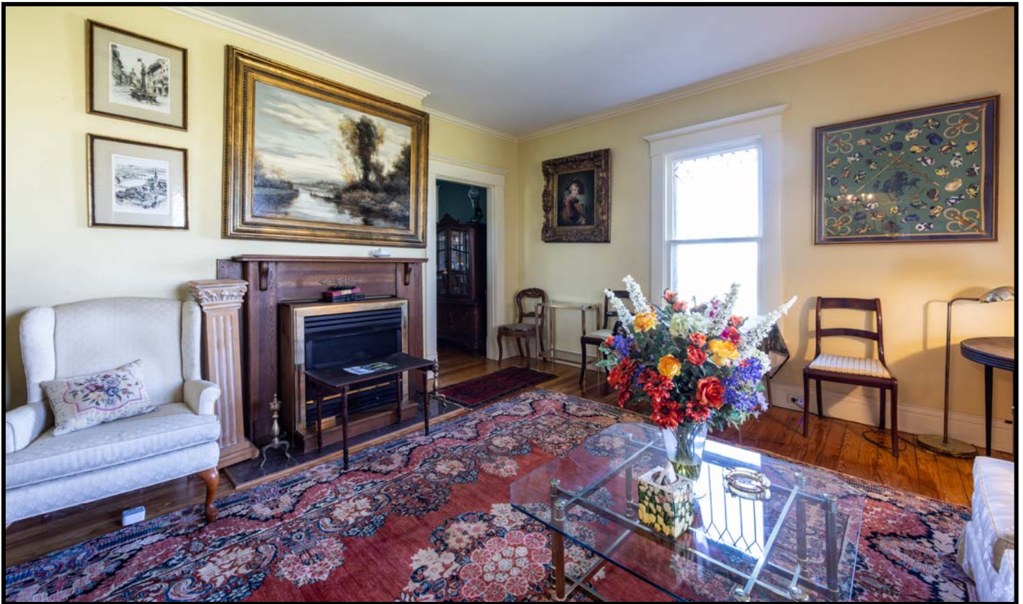
The interior boasts 3 bedrooms, 2 full baths, a living room, dining room and a wonderful kitchen/great room with a nice fireplace.