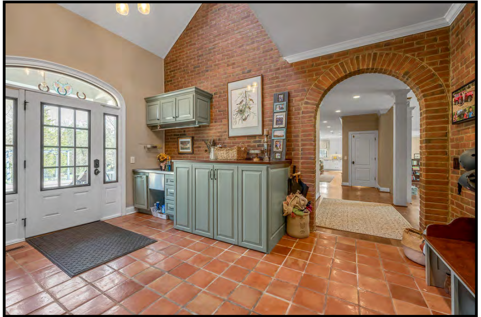
Mud/Laundry Room: Terracotta floor, skylights, chandelier, crown molding, built in cabinets, washer/dryer cabinet, laundry sink, full size Frigidaire professional refrigerator & freezer, access to garage, and access to patio/pool.