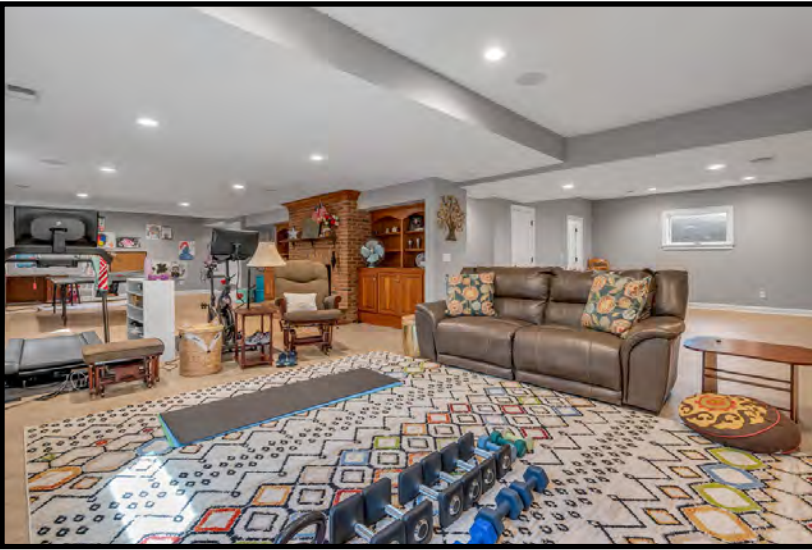
Game Room: floating vinyl tile floor, cherry built in cabinet & book shelves, brick wood burning fireplace with raised brick hearth, storage closet.