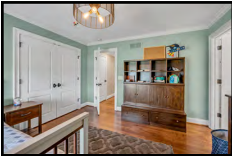
Bedroom 3 —hardwood floor, crown molding, chandelier, custom window drapery, and closet.