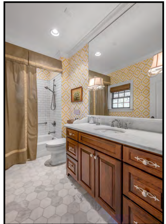
Full bath with marble tile floor, wood vanity with Quartzite countertop, tub/shower combo with custom shower curtain.