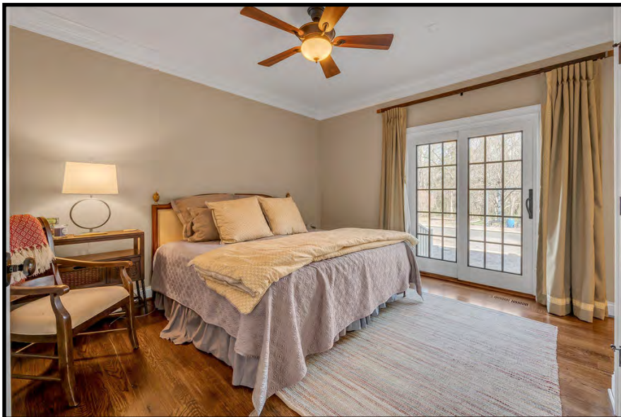
Guest Bedroom 1: hardwood floor, crown molding, ceiling fan/light, custom drapery, French sliding doors with pool access, and closet.