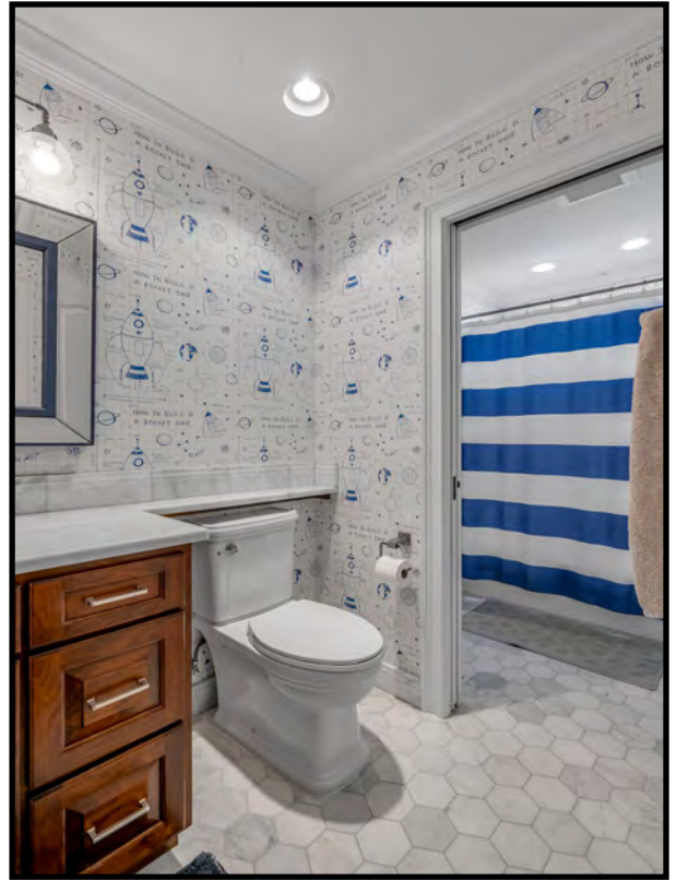
Jack- and-Jill bath: tile floor, wood vanities, Quartzite counter, tub/ shower combination.