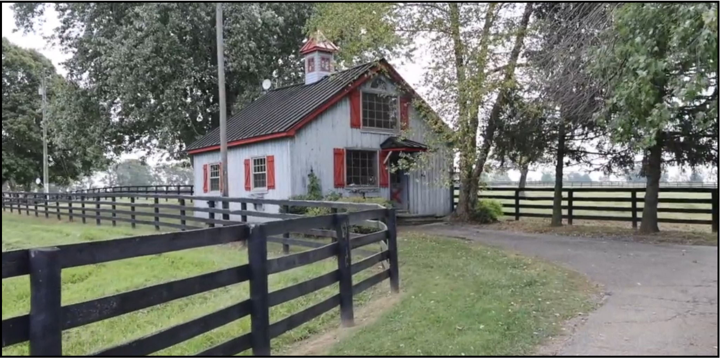
Board and batten office with full bath and kitchen consisting of approximately 835 SF.