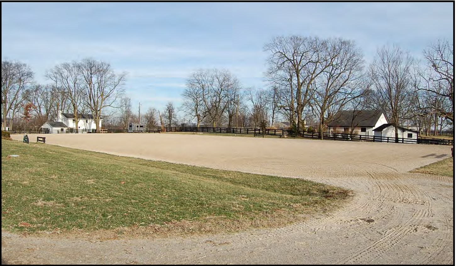
Large, irrigated 130' x 260' outdoor ring with Trutex geotextile and fiber footing, with sand mixed in. 14-12' x 12' stalls with matted floors. Large tack room.